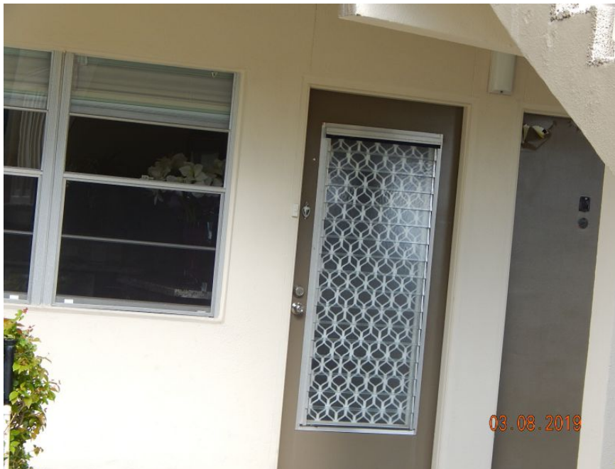
Unprotected Glazed Door