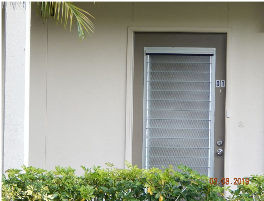
Unprotected Glazed Door