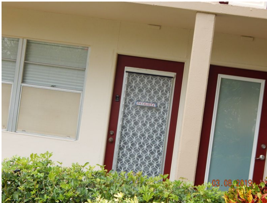
Unprotected Glazed Door