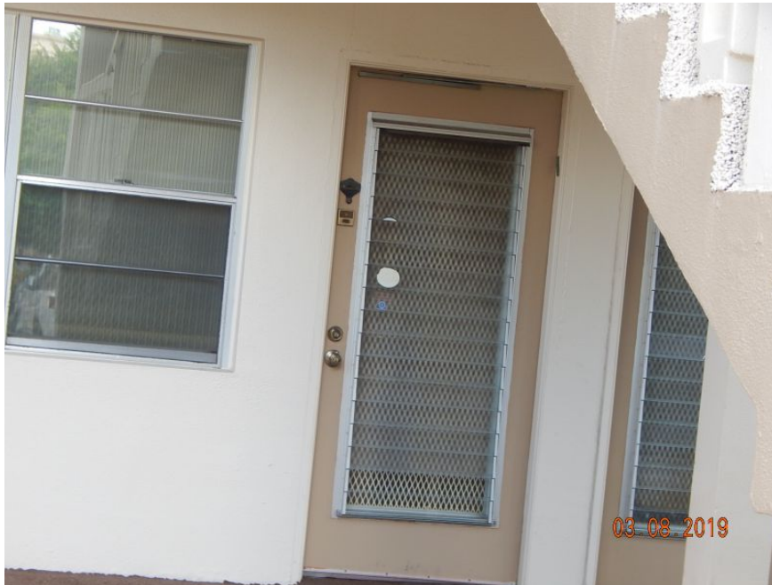
Unprotected Glazed Door