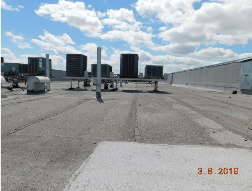
Built Up/rolled Asphalt (flat)