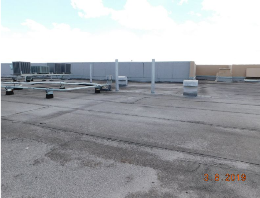
Built Up/rolled Asphalt (flat)