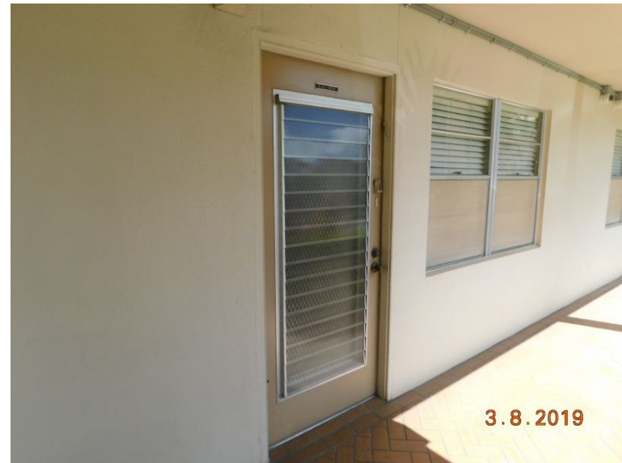
Unprotected Glazed Entry Door