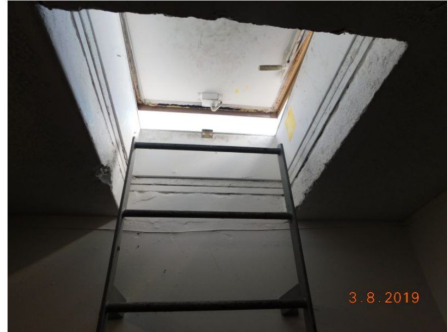
Structural Reinforced Concrete