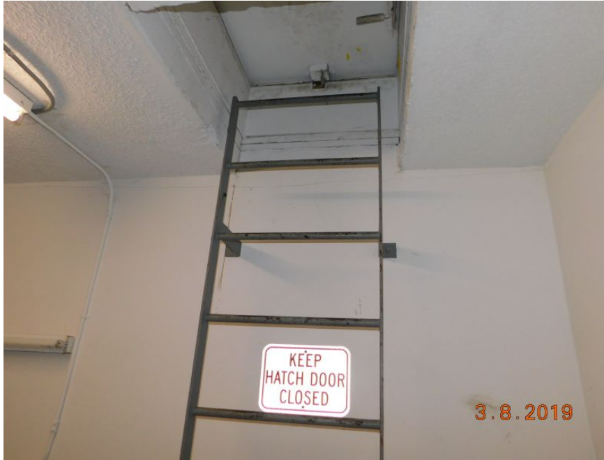
Reinforced Concrete Roof Deck