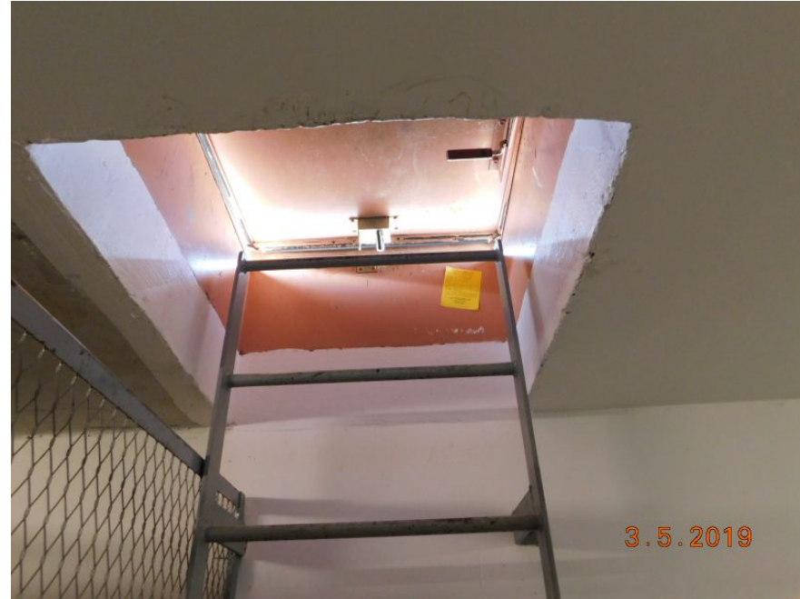
Structural Reinforced Concrete