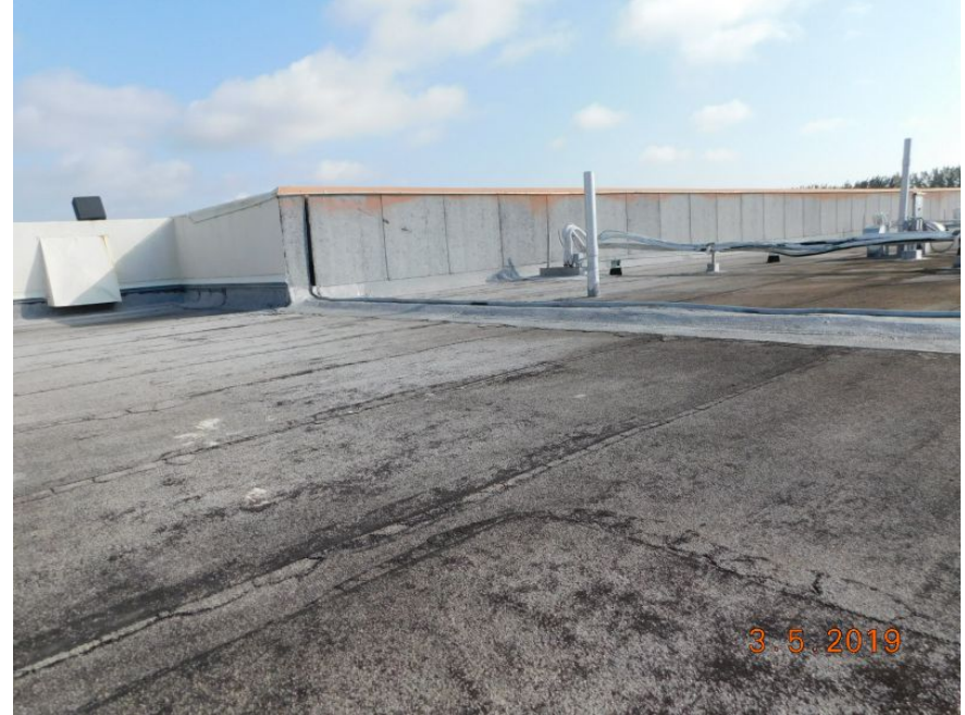
Built-up/rolled Asphalt (flat)