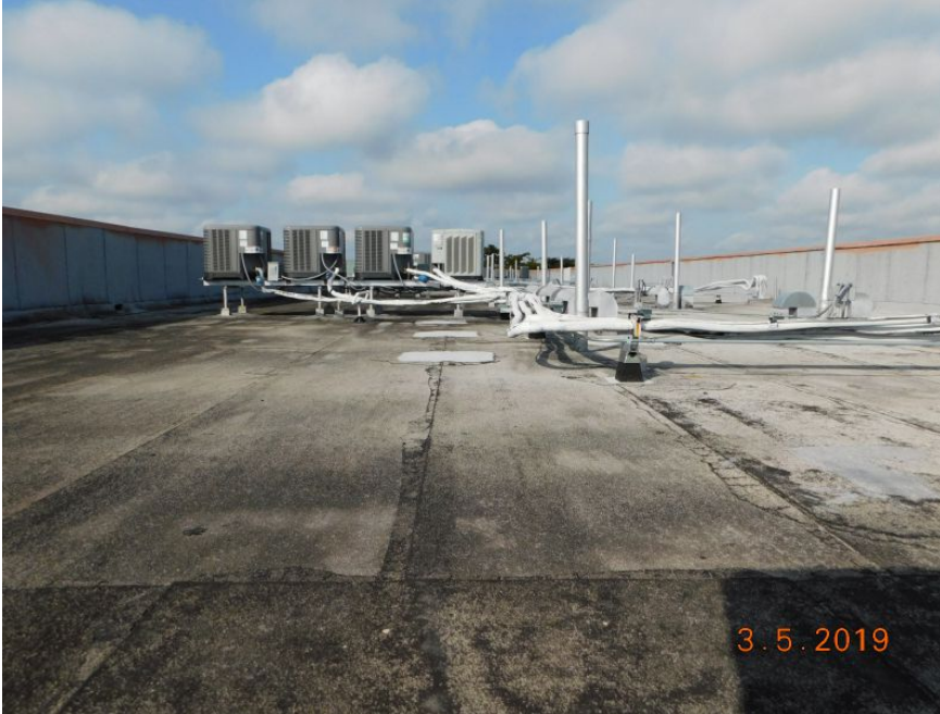
Built-up/rolled Asphalt (flat)