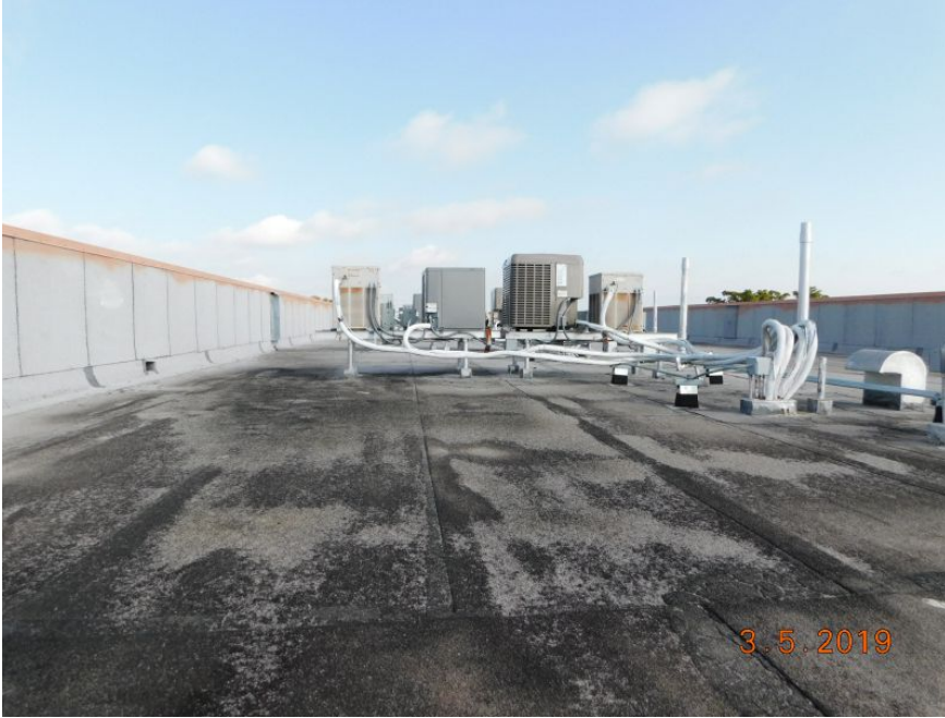
Built-up/rolled Asphalt (flat)