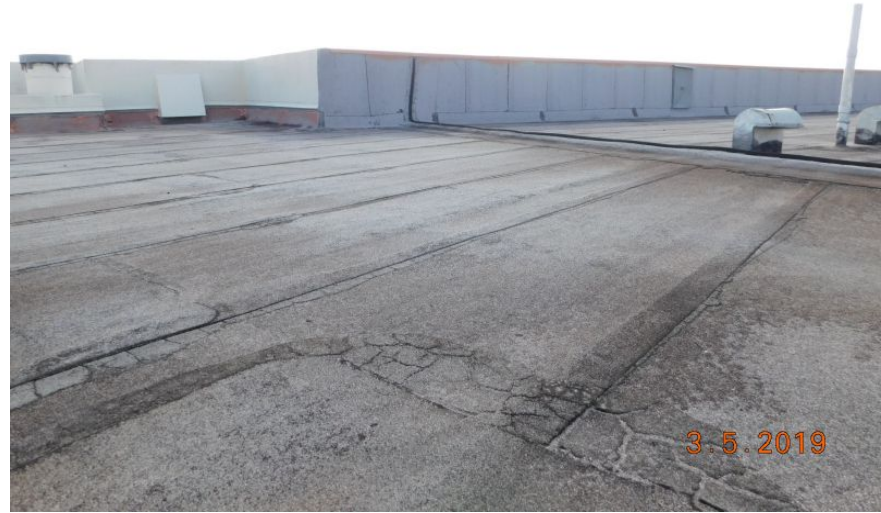
Built-up/rolled Asphalt (flat)