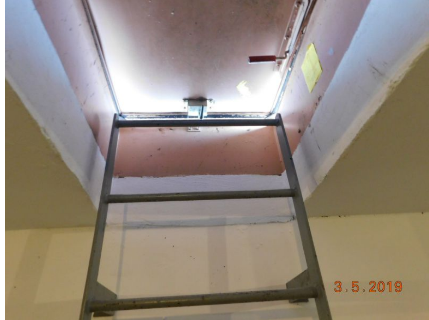
Structural Reinforced Concrete