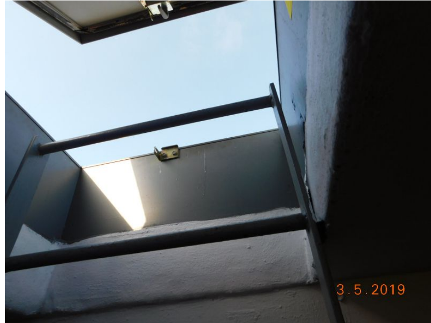
Structural Reinforced Concrete