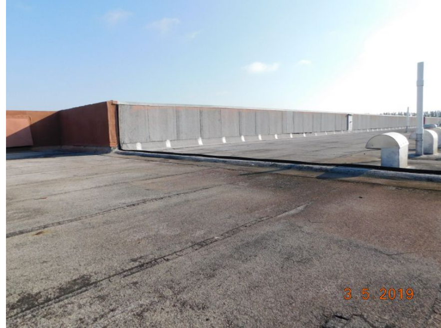
Built-up/rolled Asphalt (flat)