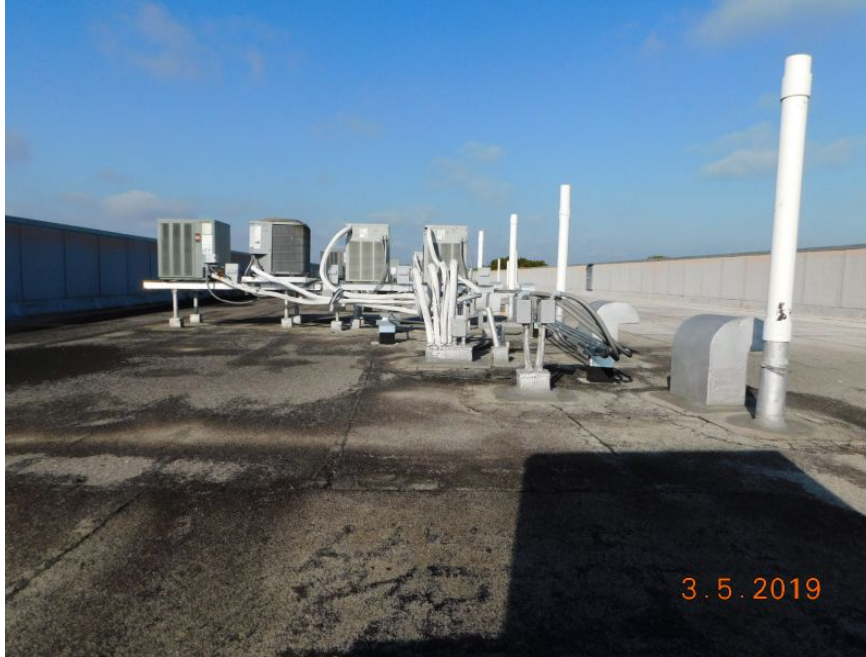
Built-up/rolled Asphalt (flat)