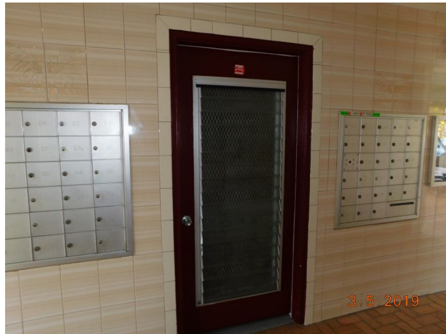
Unprotected Glazed Entry Door