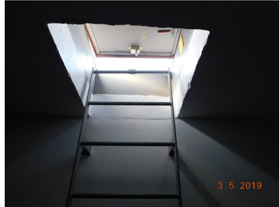
Structural Reinforced Concrete