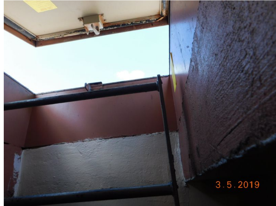
Structural Reinforced Concrete