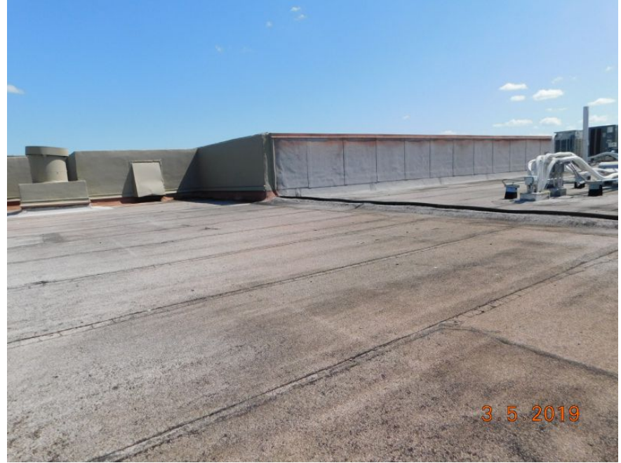
Built-up/rolled Asphalt (flat)