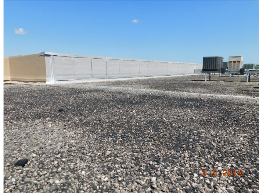
Built-Up Tar & Gravel Roof Covering