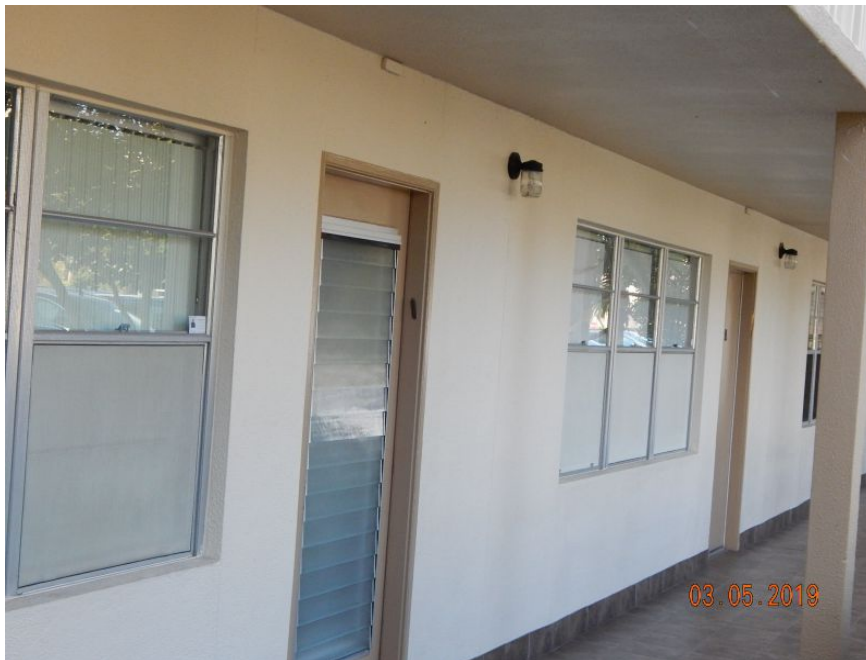
Unprotected Glazed Door