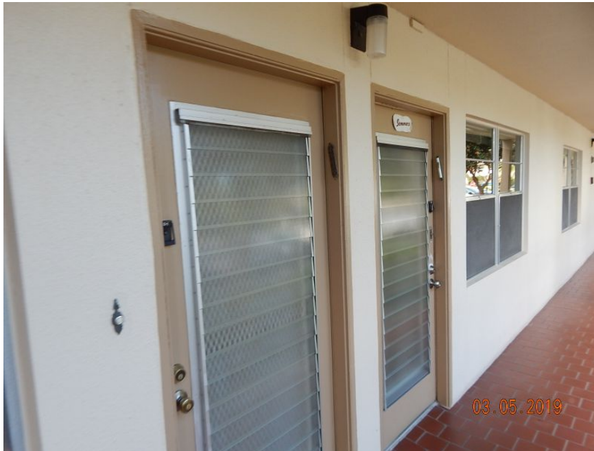
Unprotected Glazed Door