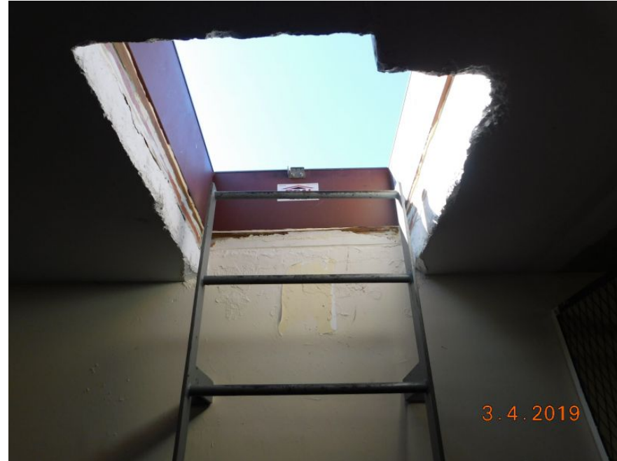
Structural Reinforced Concrete