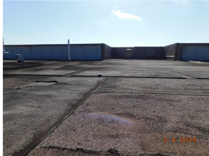
Built-Up/Rolled Asphalt Roof Covering