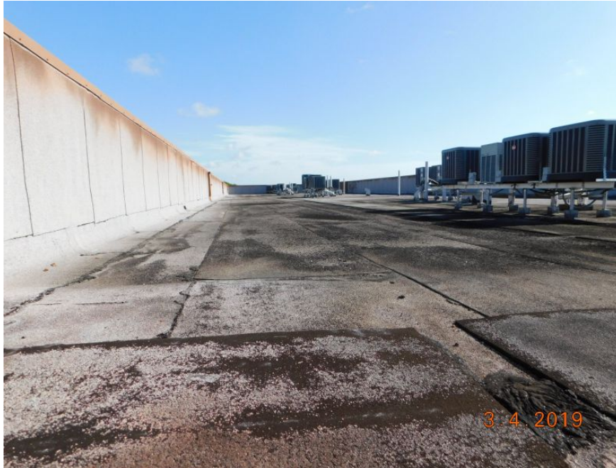
Built-Up/Rolled Asphalt Roof Covering