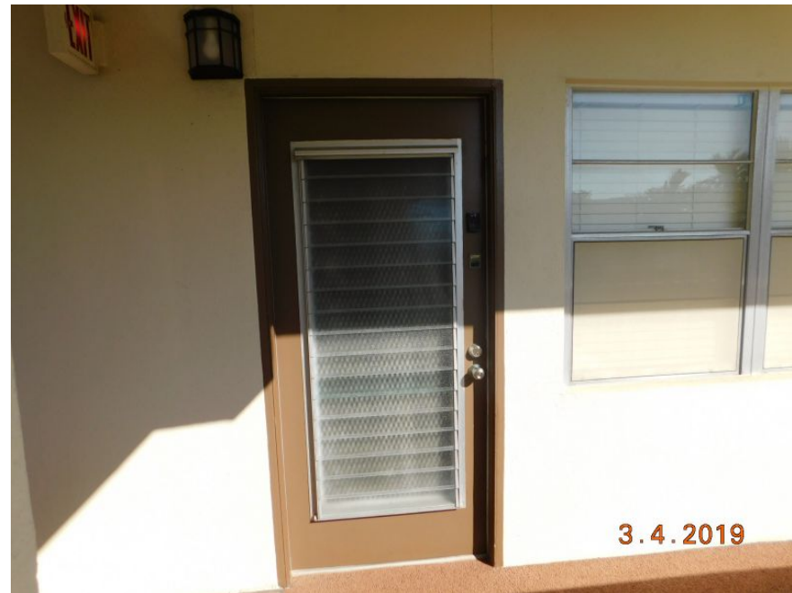
Unprotected Glazed Entry Door