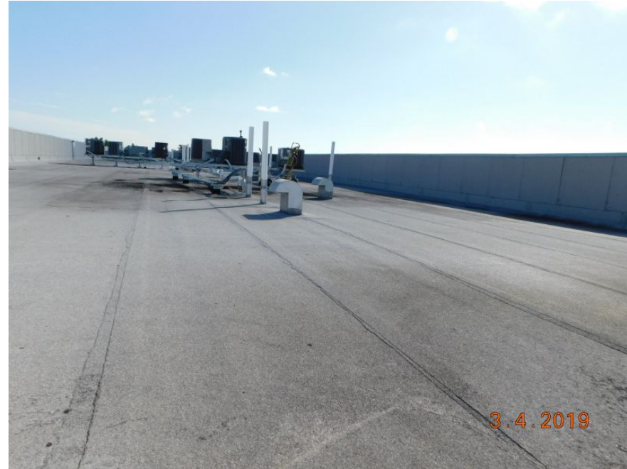
Built-up/rolled Asphalt (flat)