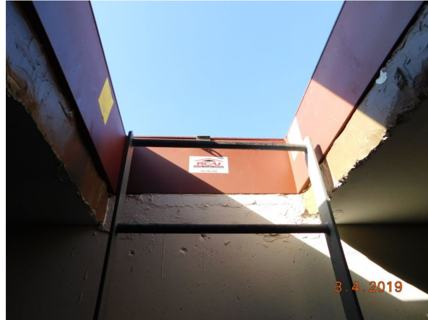
Structural Reinforced Concrete