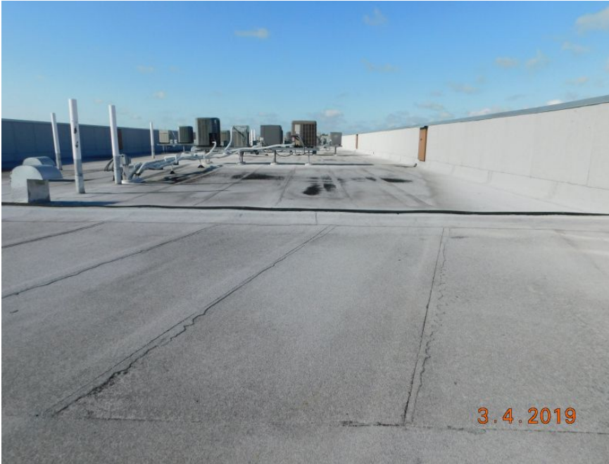
Built-up/rolled Asphalt (flat)