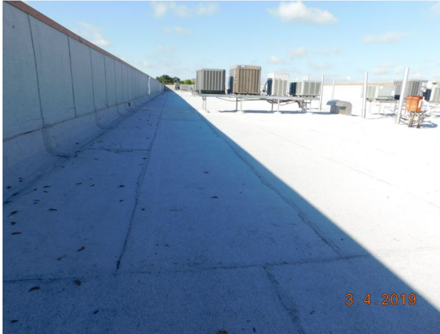
Built-up/rolled Asphalt (flat)