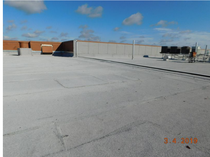
Built-up/rolled Asphalt (flat)