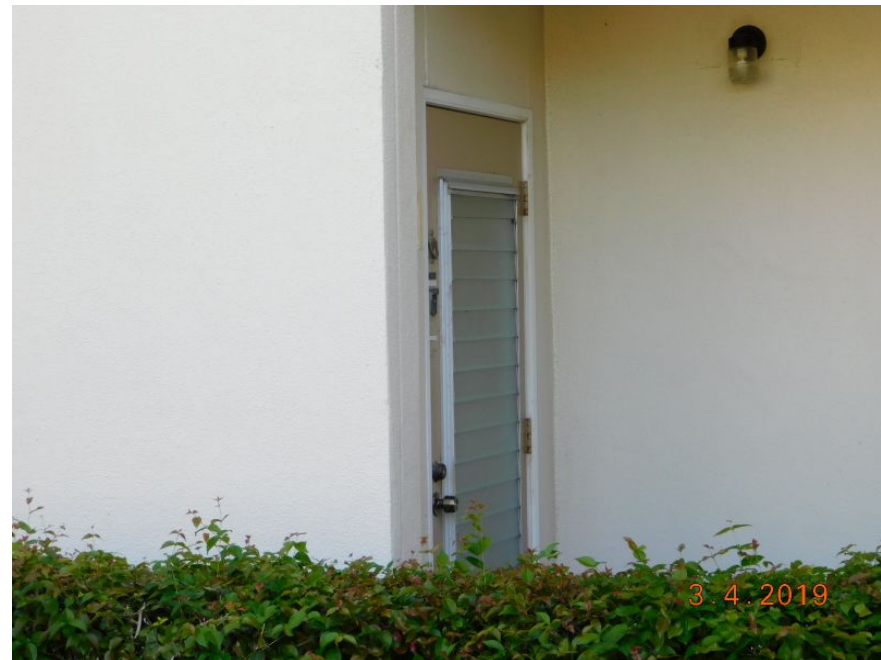
Unprotected Glazed Entry Door