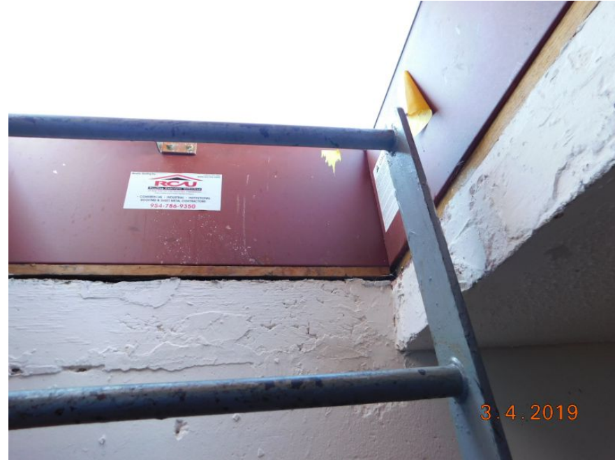
Structural Reinforced Concrete