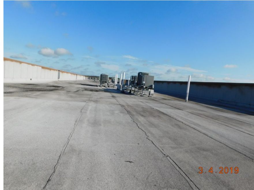
Built-up/rolled Asphalt (flat)