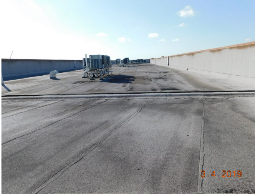
Built-up/rolled Asphalt (flat)