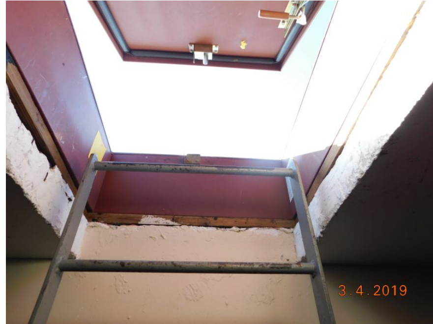
Structural Reinforced Concrete