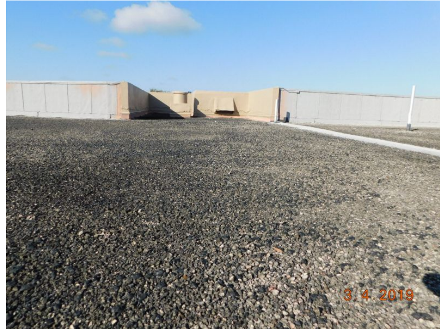
Tar & Gravel (flat)