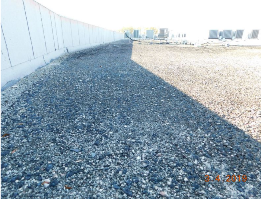
Tar & Gravel (flat)