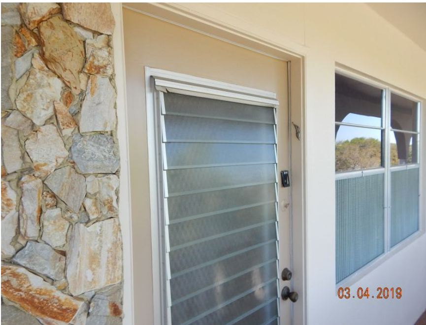
Unprotected Glazed Door