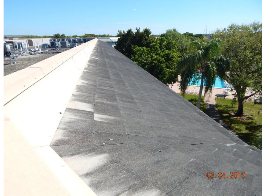
Concrete Tile Roof Covering