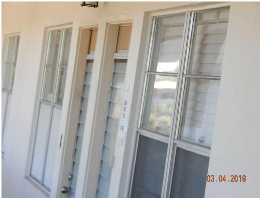
Unprotected Glazed Door