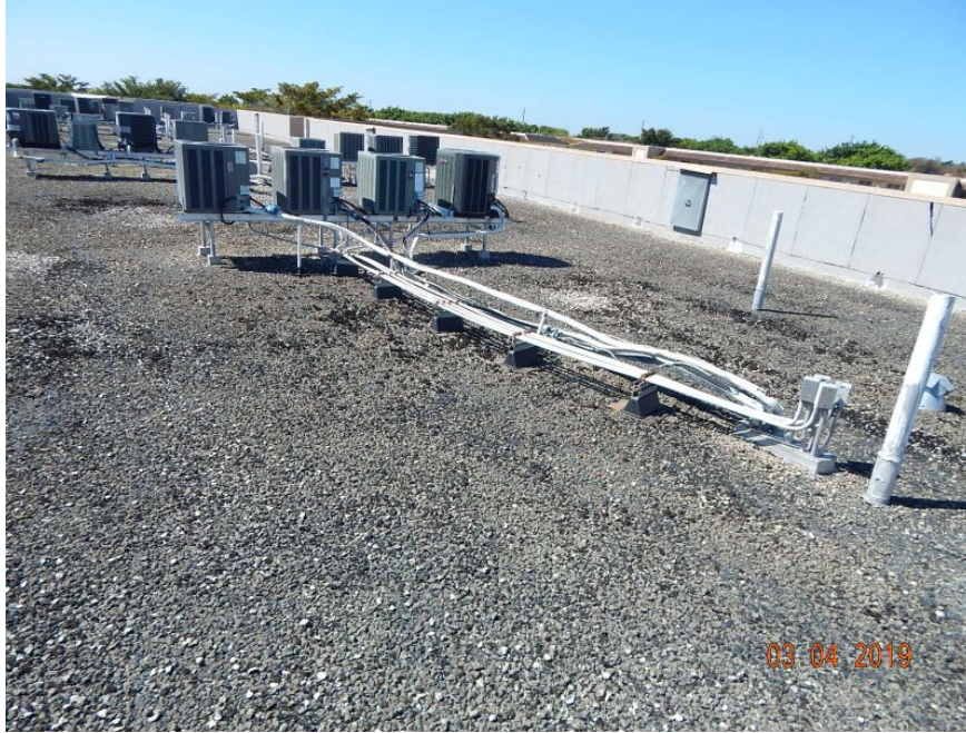
Built-Up Tar & Gravel Roof Covering