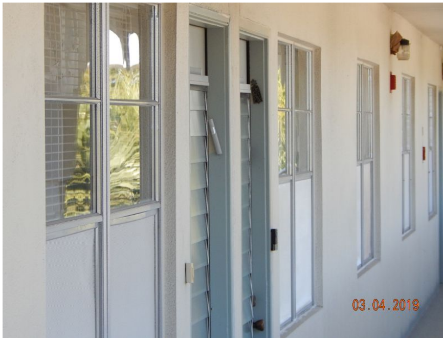
Unprotected Glazed Door