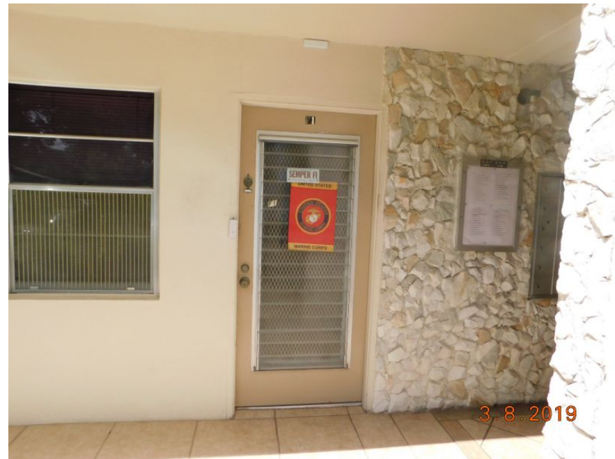
Unprotected Glazed Entry Door