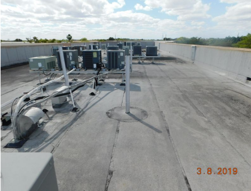
Built Up/rolled Asphalt (flat)