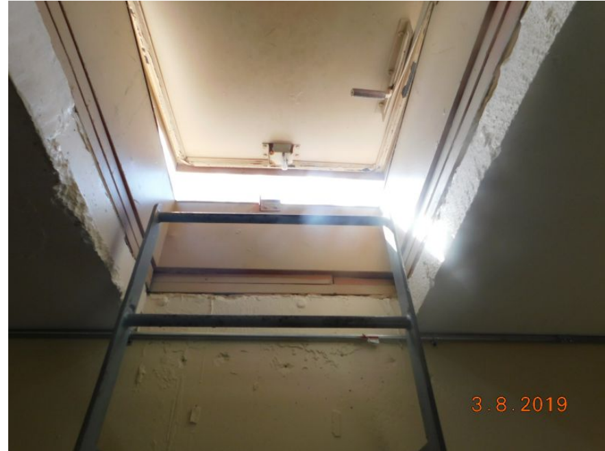
Structural Reinforced Concrete