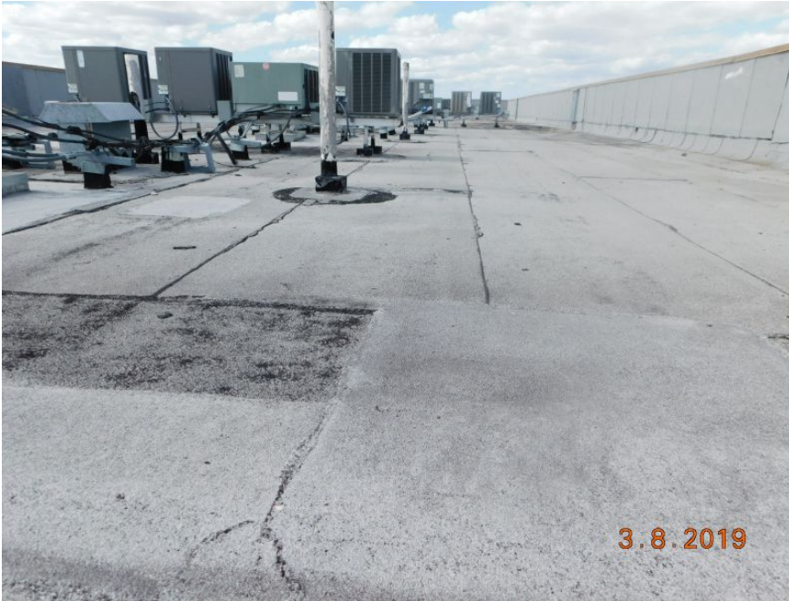
Built Up/rolled Asphalt (flat)