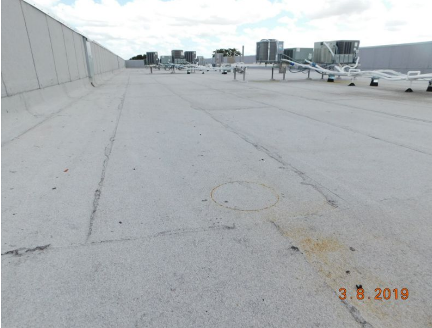
Built Up/rolled Asphalt (flat)