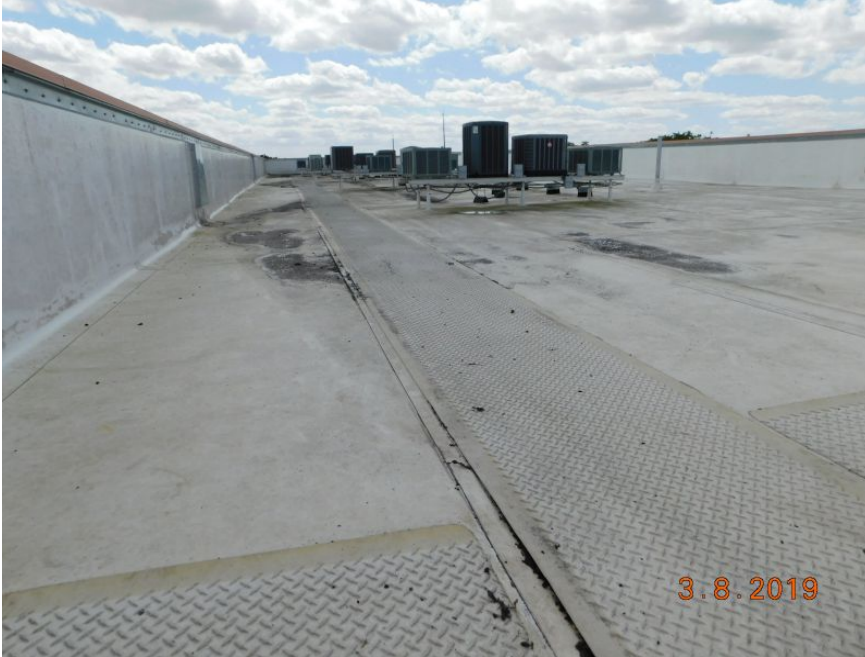
Built Up/rolled Asphalt (flat)