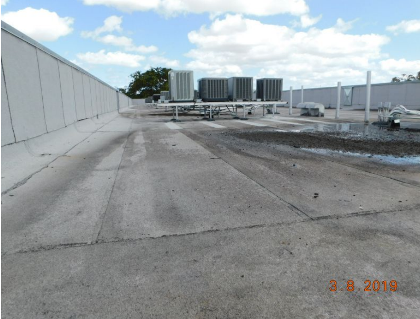
Built Up/rolled Asphalt (flat)