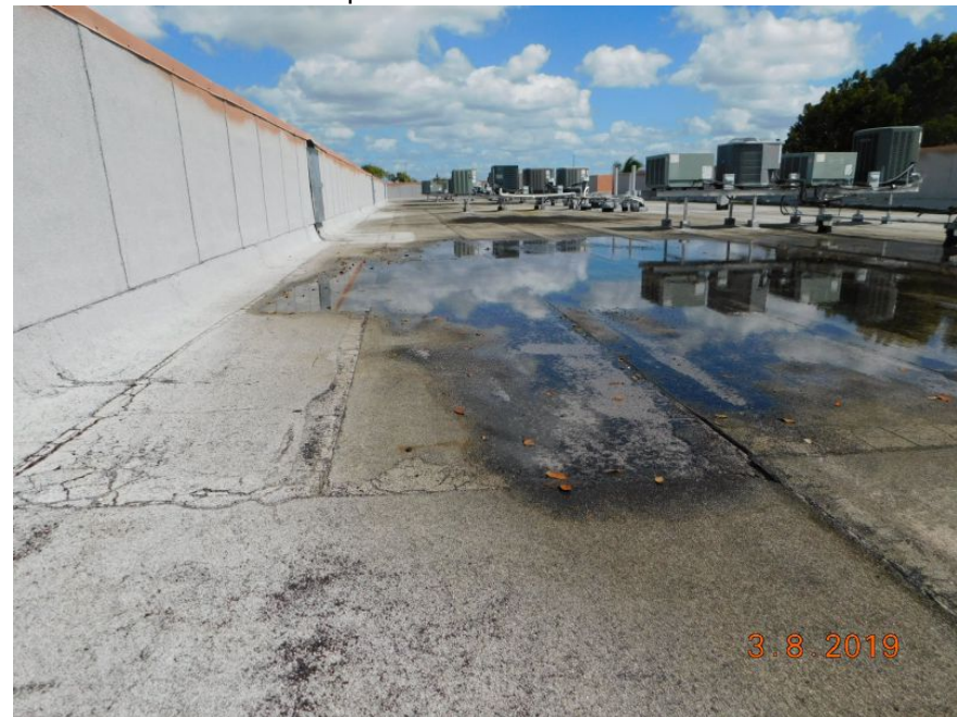
Built Up/rolled Asphalt (flat)