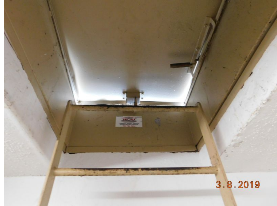
Structural Reinforced Concrete