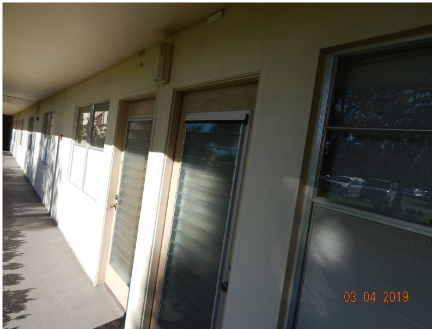
Unprotected Glazed Door