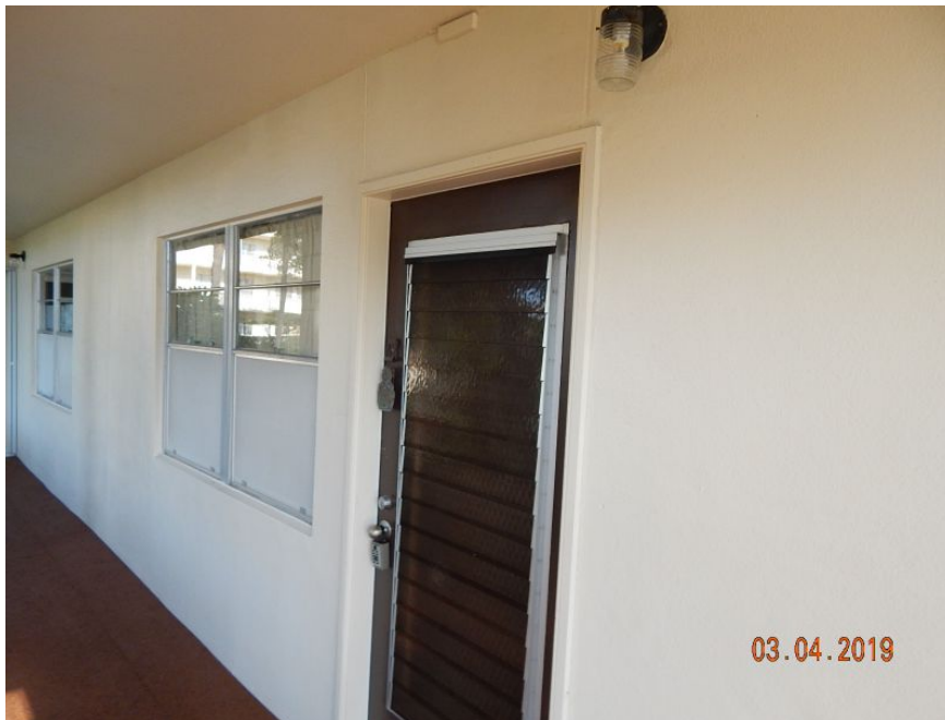
Unprotected Glazed Door