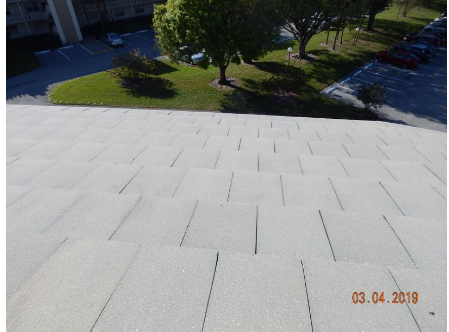
Concrete Tile Roof Covering