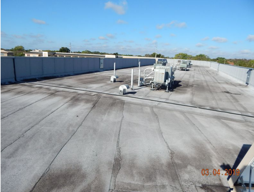
Built-Up/Rolled Asphalt Roof Covering