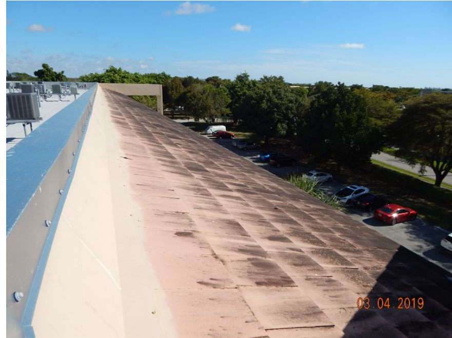
Concrete Tile Roof Covering