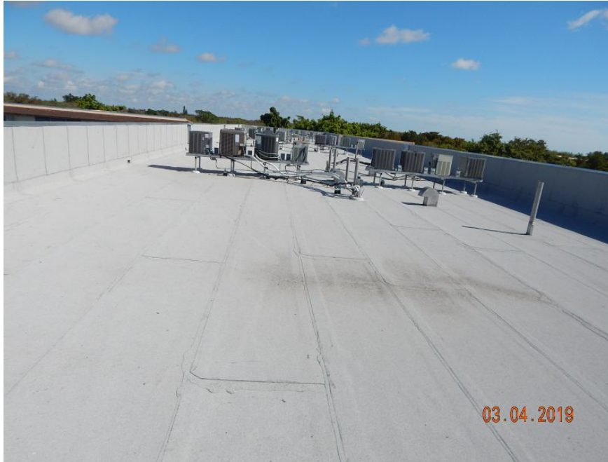
Built-Up/Rolled Asphalt Roof Covering