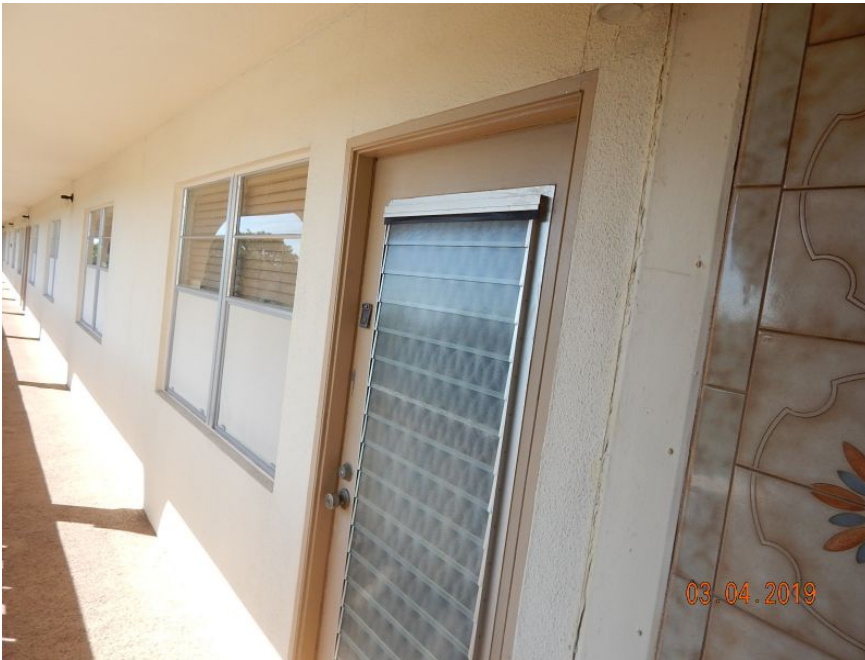
Unprotected Glazed Door