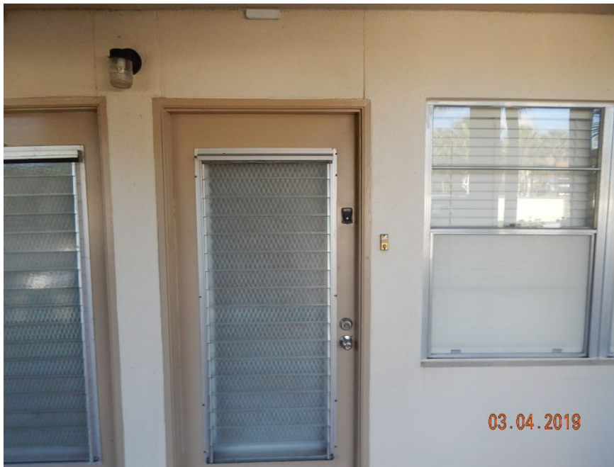
Unprotected Glazed Door