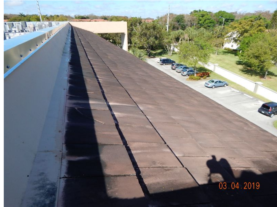
Concrete Tile Roof Covering