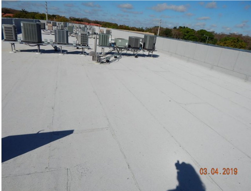
Built-Up/Rolled Asphalt Roof Covering