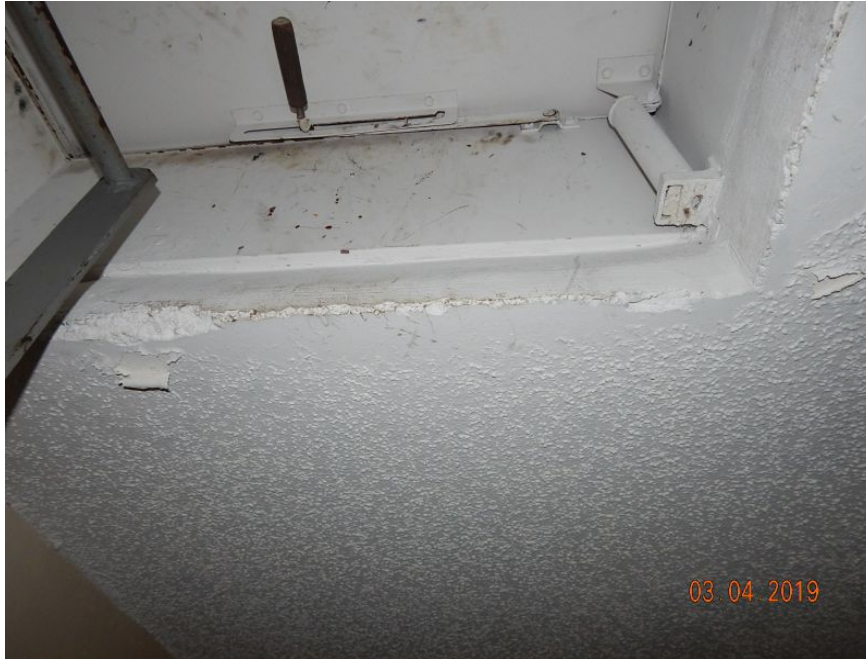
Reinforced Concrete Roof Deck