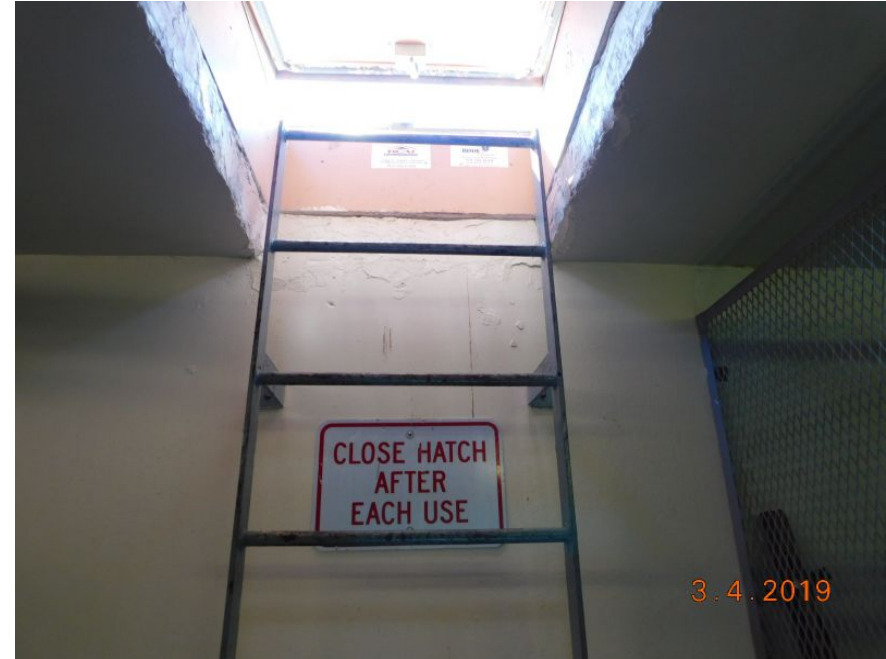
Structural Reinforced Concrete