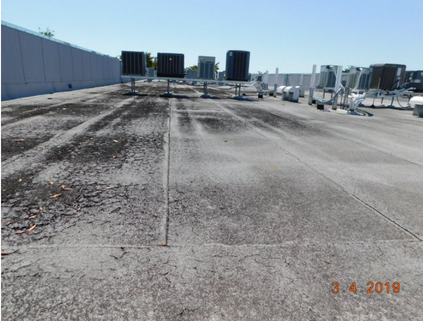
Built-up/rolled Asphalt (flat)