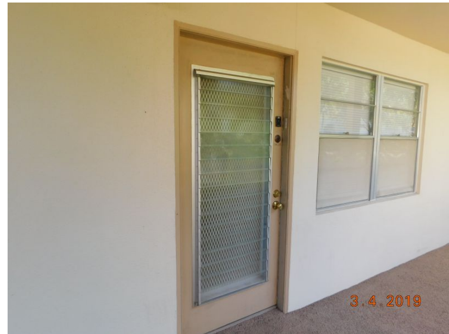
Unprotected Glazed Entry Door