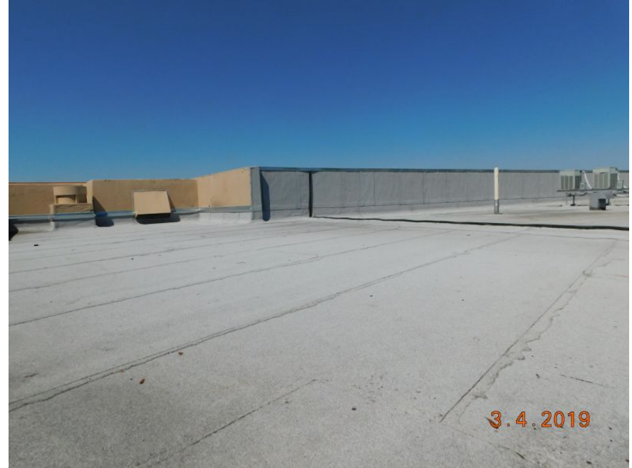
Built-up/rolled Asphalt (flat)