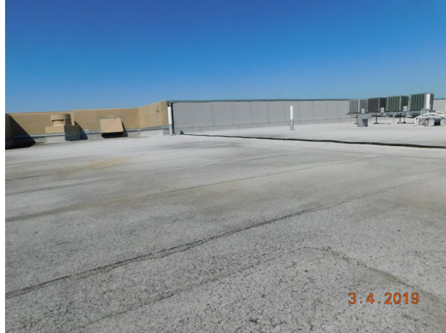
Built-up/rolled Asphalt (flat)