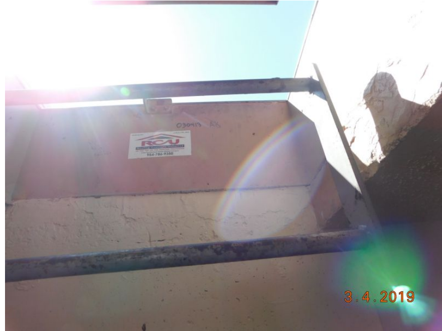
Structural Reinforced Concrete