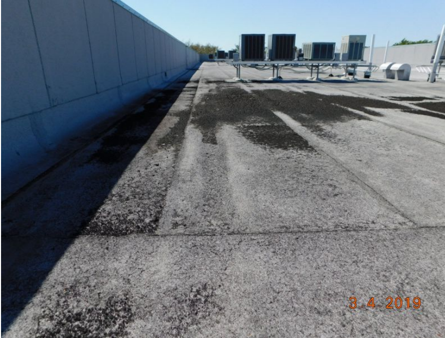
Built-up/rolled Asphalt (flat)