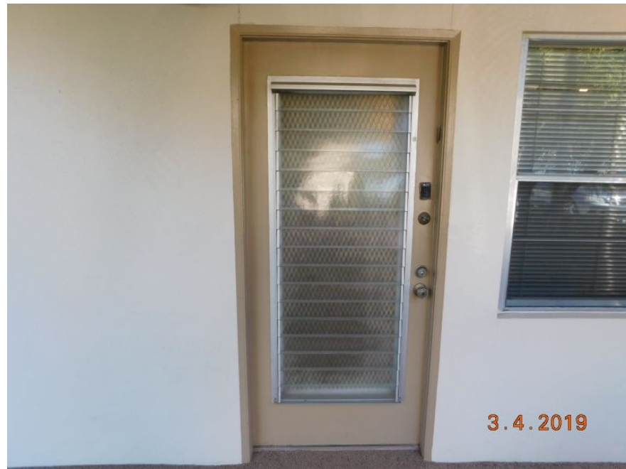
Unprotected Glazed Entry Door