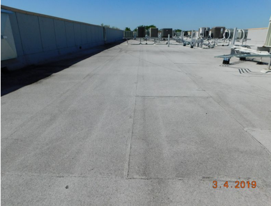
Built-Up/Rolled Asphalt Roof Covering