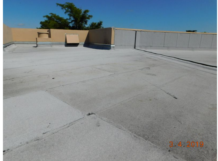
Built-Up/Rolled Asphalt Roof Covering