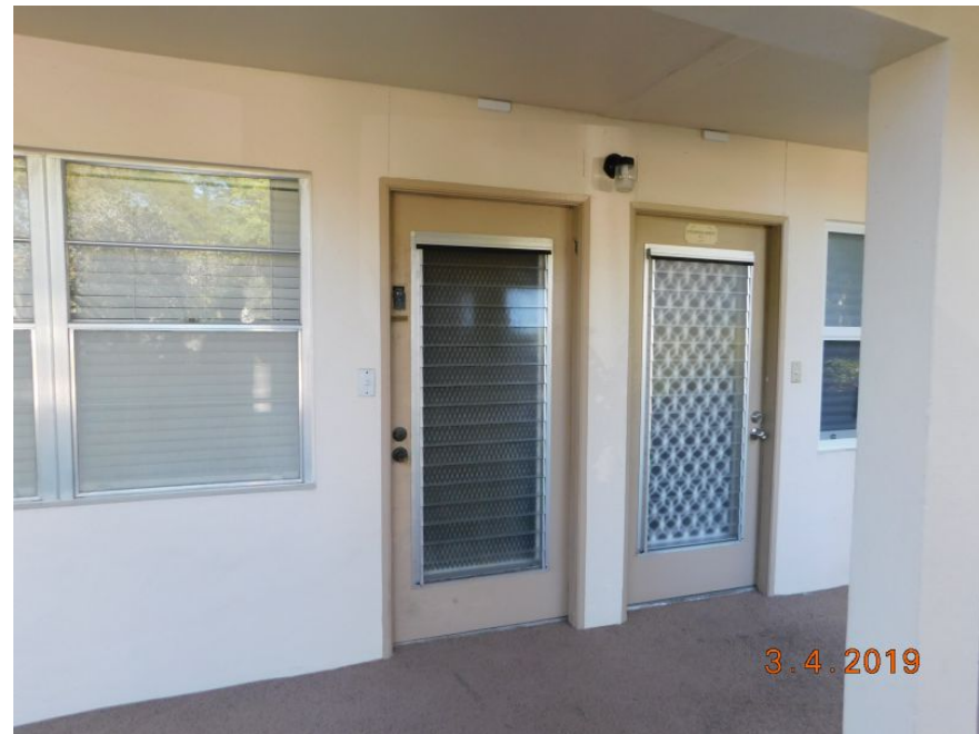
Unprotected Glazed Entry Door