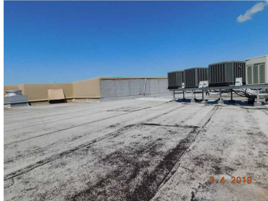
Built-up/rolled Asphalt (flat)