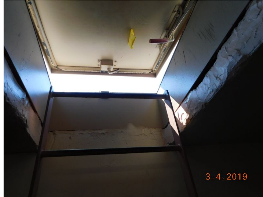
Structural Reinforced Concrete