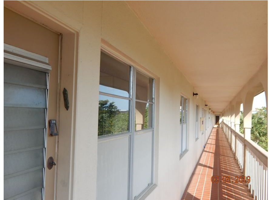
Unprotected Glazed Door