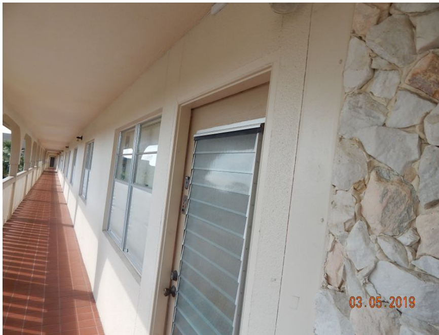
Unprotected Glazed Door