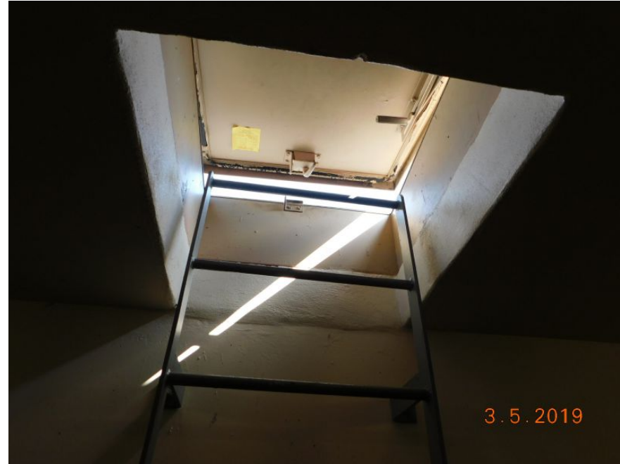
Structural Reinforced Concrete