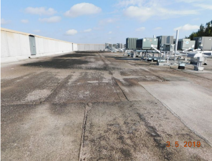
Built-up/rolled Asphalt (flat)