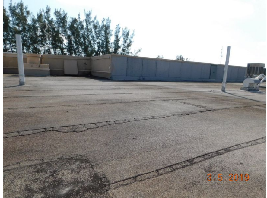
Built-up/rolled Asphalt (flat)