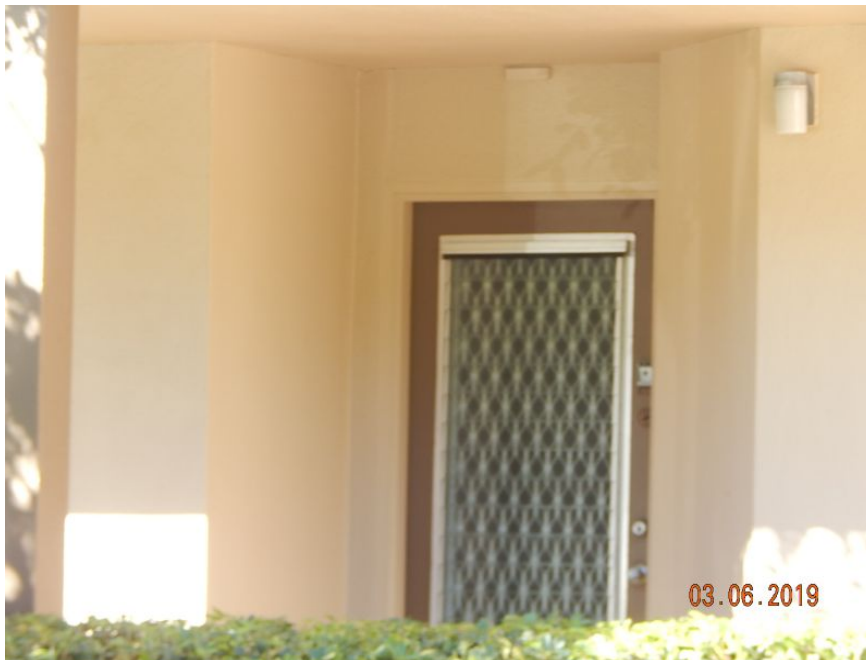
Unprotected Glazed Door