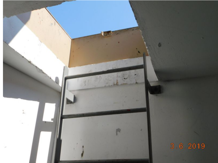
Structural Reinforced Concrete