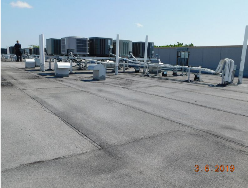
Built Up/rolled Asphalt (flat)