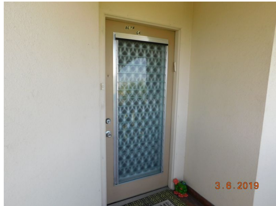
Unprotected Glazed Entry Door