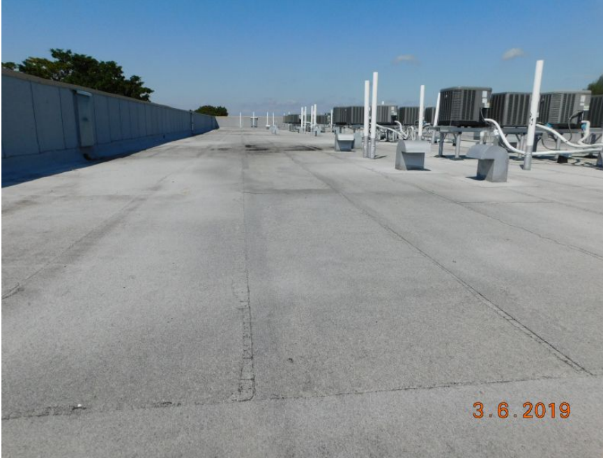
Built Up/rolled Asphalt (flat)