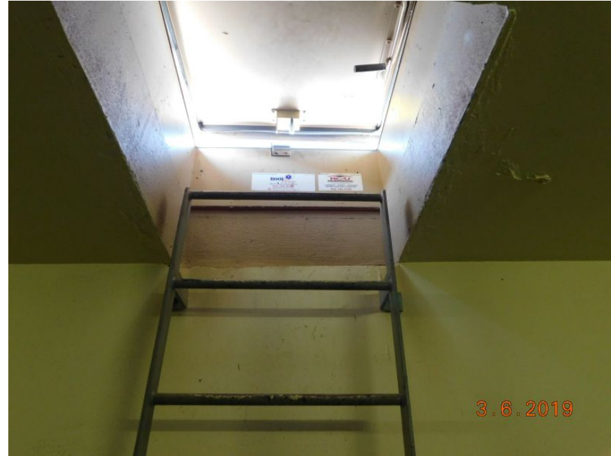
Structural Reinforced Concrete