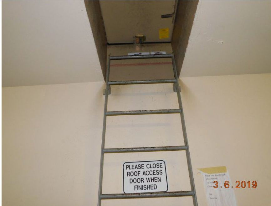
Reinforced Concrete Roof Deck