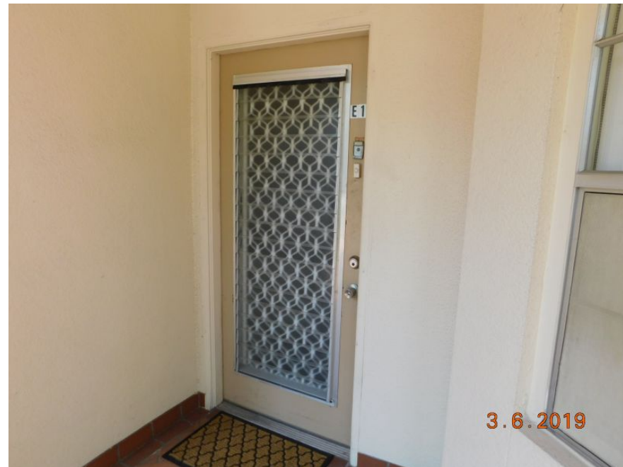
Unprotected Glazed Entry Door