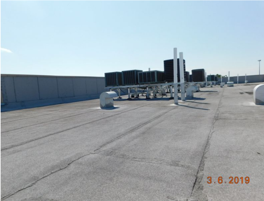
Built Up/rolled Asphalt (flat)