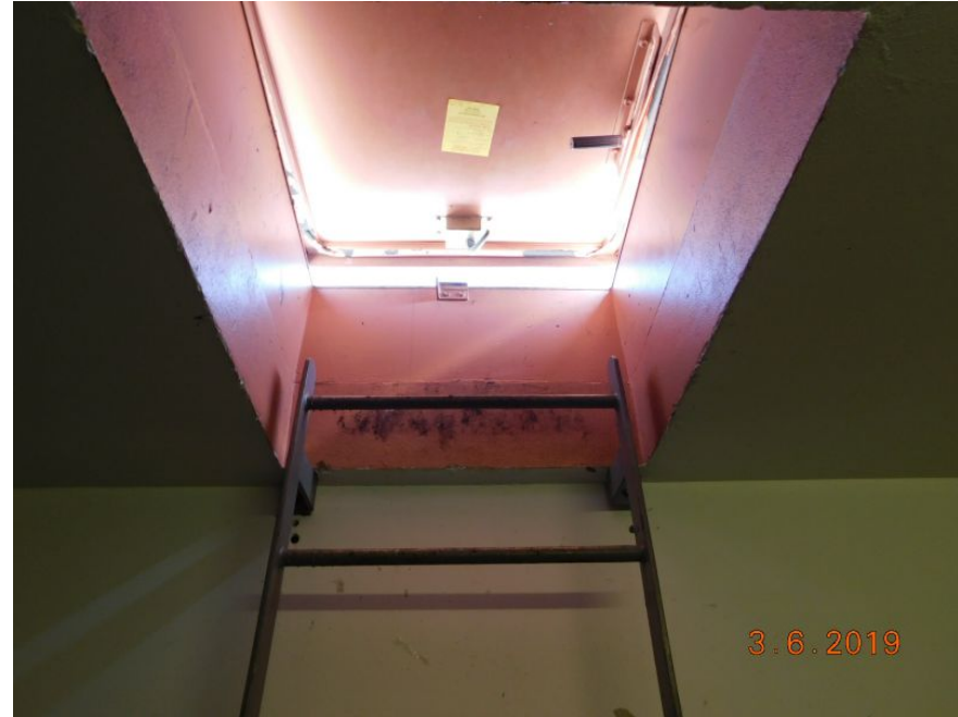
Structural Reinforced Concrete