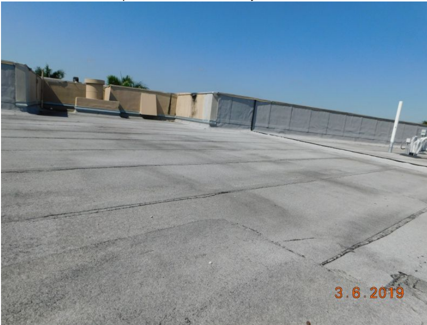
Built Up/rolled Asphalt (flat)