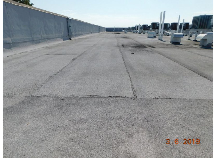
Built Up/rolled Asphalt (flat)