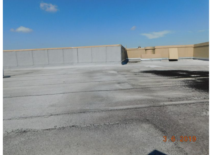
Built Up/rolled Asphalt (flat)