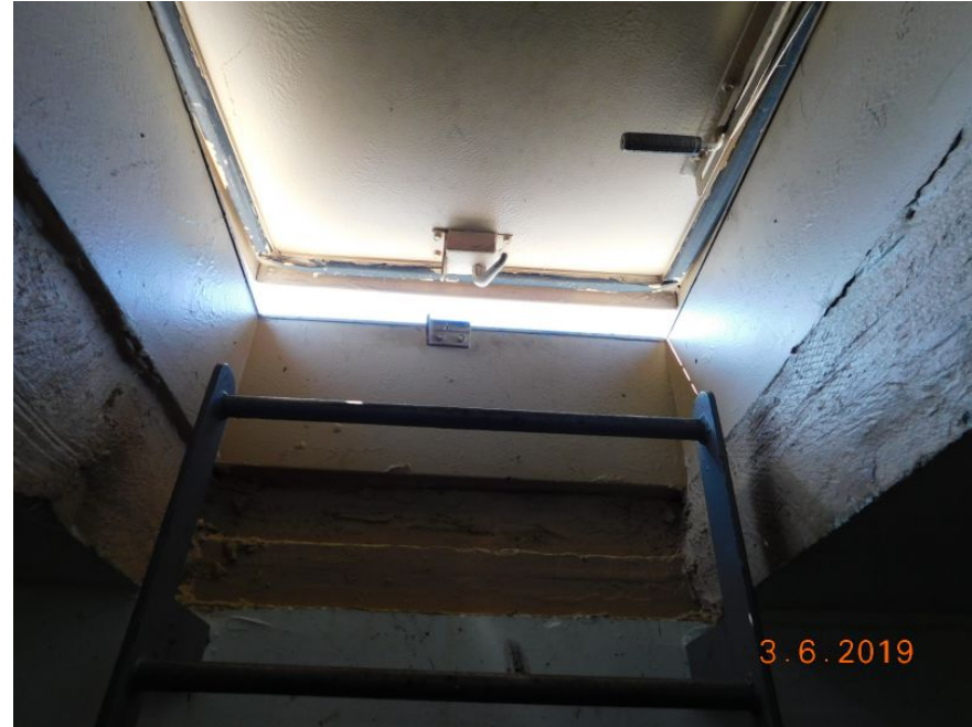
Structural Reinforced Concrete