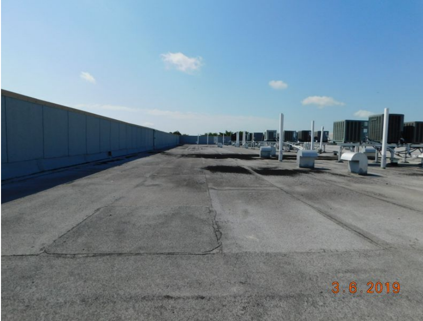
Built Up/rolled Asphalt (flat)