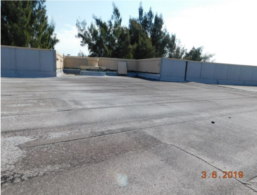
Built Up/rolled Asphalt (flat)